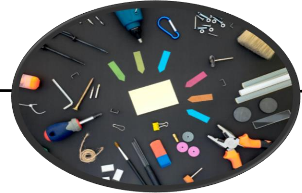
Design guidance & resources