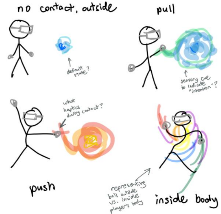
Sketch of VR intervention design for remote dance practice, Energy Beast